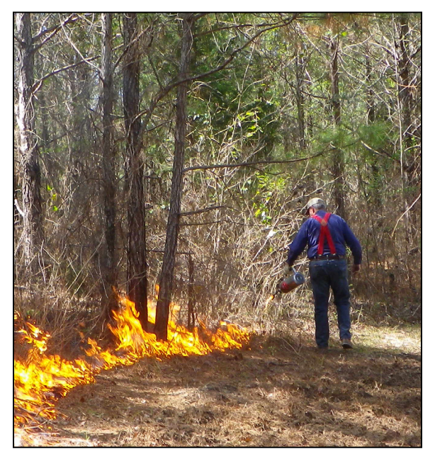
Prescribed fire, often associated with longleaf pine forests, can also be an effective management tool to control hardwoods in shortleaf pine stands.