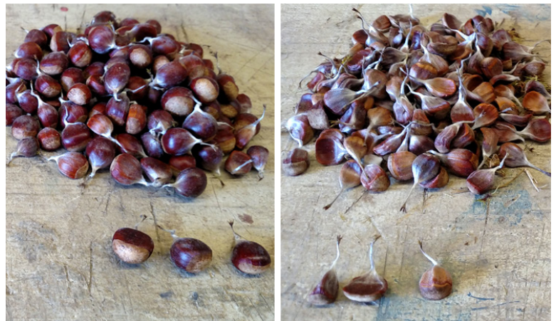
Figure 1: Pollinated (left) vs. unpollinated nuts (right).

Chestnut flowers develop into burs whether the burs contain viable nuts or not. This can make it difficult to find the good ones ( Figure 1 ). Burs that were not pollinated will start to open and drop nuts as much as a week before the fruitful burs, which can make harvest timing a little tricky. Luckily, when many of the unpollinated burs are opening it is then possible to spot the fruitful burs—not only will they still be closed they will also commonly be bright green, in contrast to the brownish color of the empty burs.