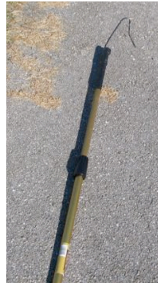
Figure 3: Pole with hook; a useful tool to use when harvesting.

If saving the nuts for planting, place them in damp (NOT WET!) peat moss as soon as they are removed from the burs. The peat moss should be damp enough that you can squeeze it into a ball but not so damp you can squeeze water out of it. Get an even distribution of nuts within the peat. It is very important to use sterile peat, not potting mix or other dense media. Not using sterile peat will encourage the proliferation of mold, as will having peat moss that is too wet. Place the nuts and peat in a plastic bag or Tupperware container that has been punched with holes. This allows the nuts to breathe and reduces molding. Be sure to label the bags with the number of nuts contained in the bag and the mother tree and/or cross information. At this point, you should ship them to your TACF state chapter contact or regional science coordinator for storage, or store the nuts yourself in the refrigerator. The ideal storage temperature for chestnuts is approximately 34°F, and even at this cold temperature the nuts will probably sprout by late winter or early spring. Do not freeze chestnuts, as extended freezing will reduce the chances of successful germination after planting.