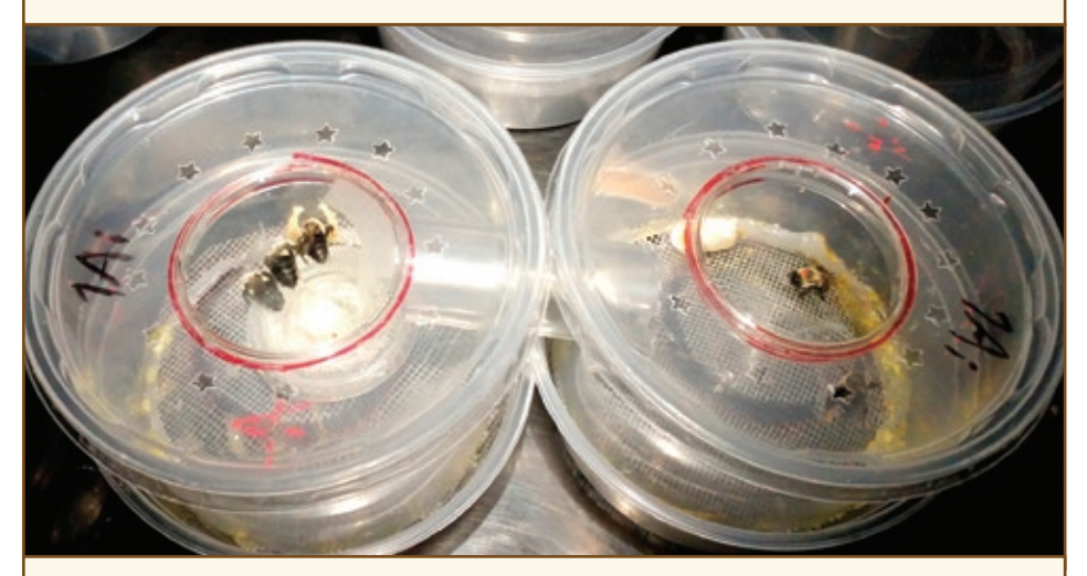
Example microcolony containing five native bumble bees ( Bombus impatiens ) and pollen with OxO. Two connected chambers allow separate feeding and nesting areas.

FDA for their regulatory analysis of the transgenic chestnut, since chestnuts can be used as livestock feed. We had tannins analyzed at an independent testing facility, and results showed substantial variation in tannin concentrations among different types of non-transgenic chestnuts – it's clear that growing conditions or ancestry make a difference. However, transgenic and related non-transgenic American chestnuts showed almost identical tannin concentrations.