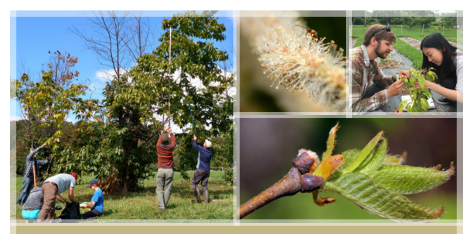
THE AMERICAN CHESTNUT FOUNDATION ANNUAL REPORT JULY 1, 2017 – JUNE 30, 2018