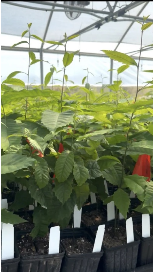
Chestnut seedlings at TACF's Meadowview Research farms.

MDTACF Spring Membership Meeting Staff News Orchard News Planting Chestnuts