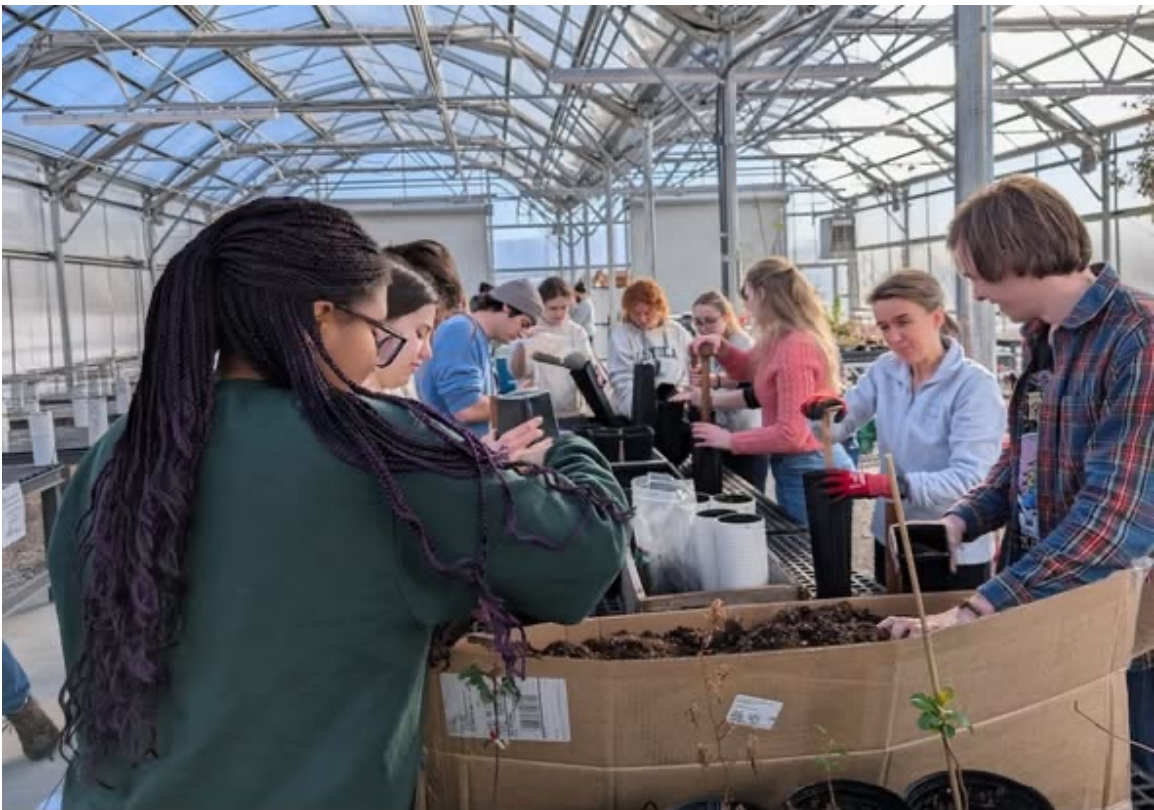
The second assembly line. Thanks to all the Loyola University students.