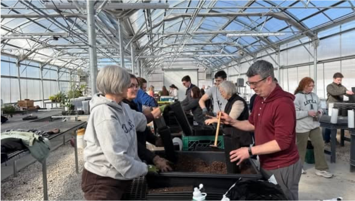
The assembly line, filling pots with potting mix.