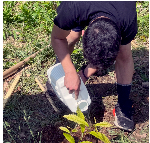
Watering a newly planted seedling at CMR.