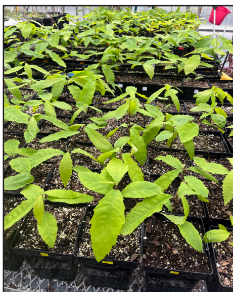
Some of the 1300 seedlings in the WVU greenhouse in 2022.