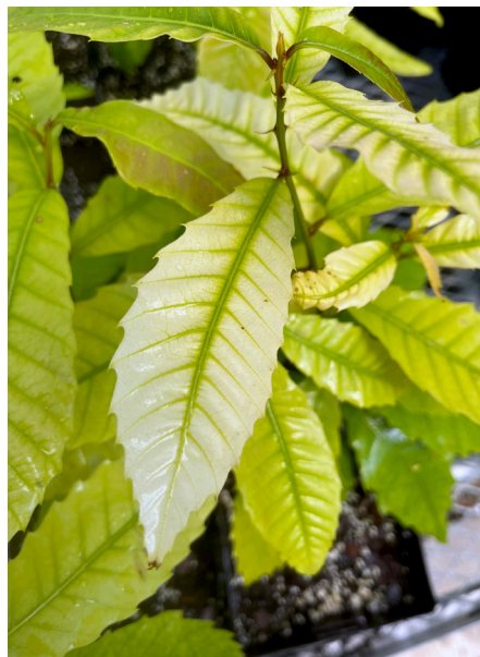
Bleaching of upper leaves shows good color in the veins but a lack of color in the leaf tissue.

Since the seedlings are grown in 4" pots, the roots generally fill the pot in two months. Sara Fitzsimmons , recommends 10" deep pots, but those deeper pots require stands which our chapter does not have. During mid-May, bleaching of the upper leaves was noticed in some of the seedlings. Sara felt this bleaching was due to a root that was trying to get down deeper into the pot but was unable due to the size of our pots. The affected leaves were the new leaves, not the older ones as seen in the