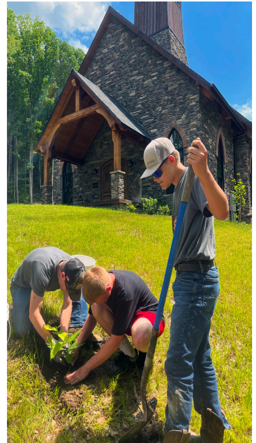
Planting in front of the chapel at CMR.

fly-tying. It seemed only fitting to plant American chestnut seedlings at Chestnut Mountain Ranch. All 18 boys along with staff assisted with the planting.